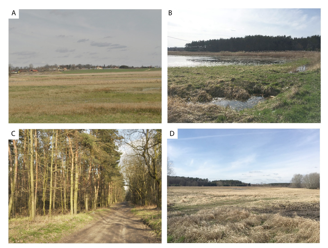
Fig. 3. A, B, C, D – the sceneries presented in the research of social landscape preferences

In order to verify the expert assessment of the landscape attractiveness a pilot survey was carried out. It consisted in giving 4 photographs representing 4 different sceneries to a group of respondents (see: Fig. 3): the skyline of the Sobota village with a farmland within the foreground of the exposition (A), a vast view of Samica River with a forest wall in the background (B), a framed view of the forest road (C), a vast view of the meadow with a forest wall in the background (D). Presented sceneries differed in terms of land's shape and covering, and the proportion of natural and cultural elements. Respondents were asked to rank the photographs by the visual attractiveness criterion following the principle that the least attractive view was to